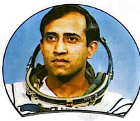
First Indian in space (1984)