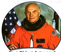
First Oldest Astronaut in Space (1962)