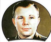
First person in space (1961)