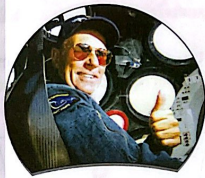
First Commercial astronaut (2004)