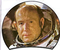
First space walk (1965)