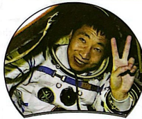
First Chinese astronaut (2003)