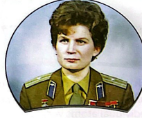
First woman in space (1963)