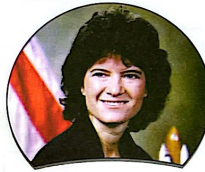
First US woman in space (1983)