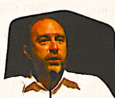
Jimmy Donal Wales