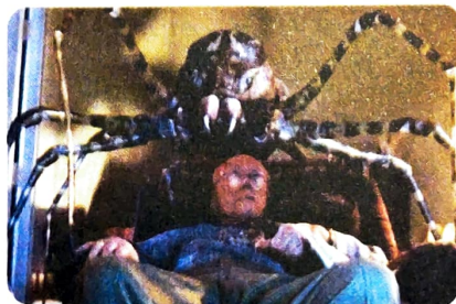
Eight Legged Freaks