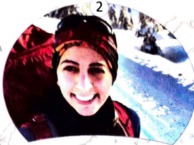
First woman to complete a harrowing 1126 km journey to the South Pole solo.