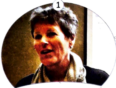
First woman to reach the South Pole.

The North and the South poles are two of the most difficult places on the earth to reach and so have been great challenges for explorers. There are many people who reached the poles by one means or another. Identify the following first polar explorers.