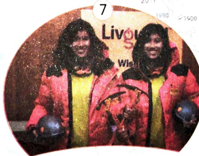
The first Indian twin sisters to scale both the North and South Pole on skis.