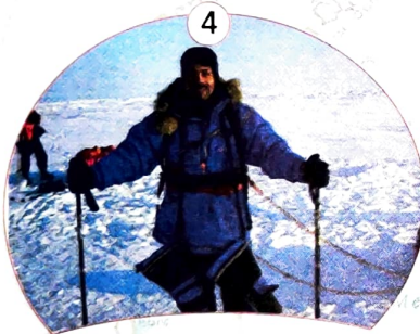
First Indian to have skied to both the North Pole and the South Pole