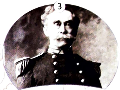
First to reach the North Pole.