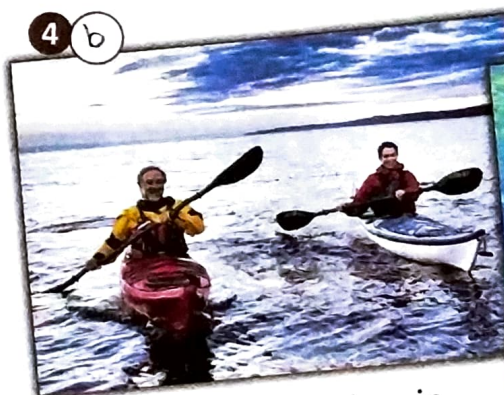
Riding a fast flowing river in a narrow canoe like boat.