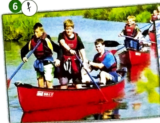
Racing of boats on island rivers with many oars.