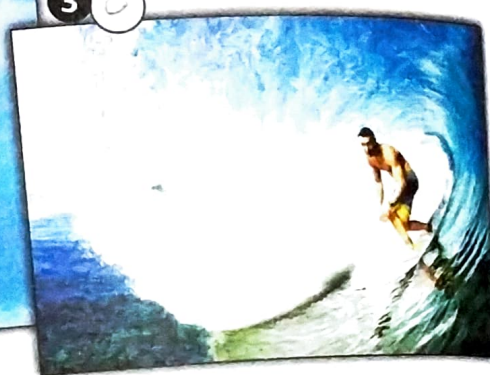
Riding over high waves coming in towards the shore on a surfboard.