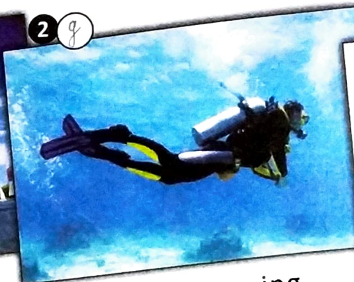
Underwater swimming with the help of aqua-lung.