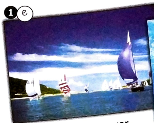
Racing in sail or power-driven boats.