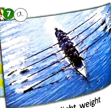
Riding a small light weight boat with flat ended oars.