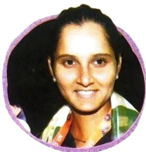
This is Sania Mirza. She is a Tennis Player.