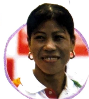
This is Mary Kom. She is a Boxer.