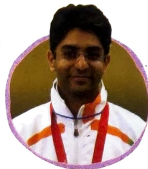
This is Abhinav Bindra. He is a Shooter.