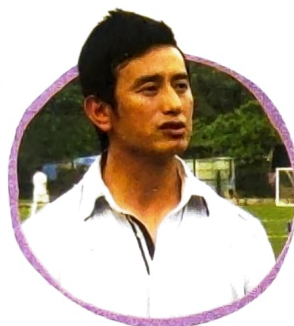
This is Baichung Bhutia. He is a Football Player.