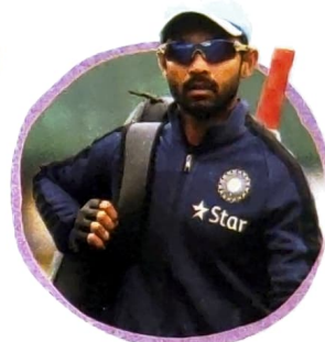
This is Ajinkya Rahane. He is a Cricketer.