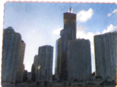
An apartment block

An apartment block is a large building which has many storeys where many families live.